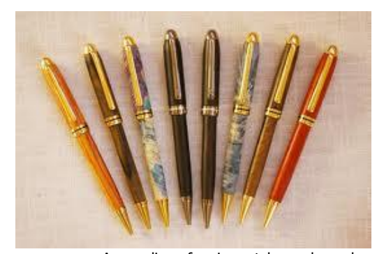
A sampling of various styles and woods