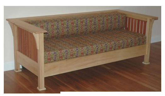
Mission style sofa made of Cherry and Sycamore