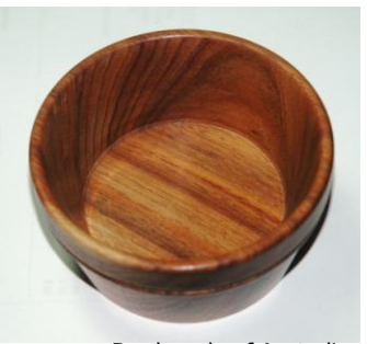
Bowl made of Australian Blackwood

From wine stoppers, to bowls, to personal use items, all of our work is "one of a kind."